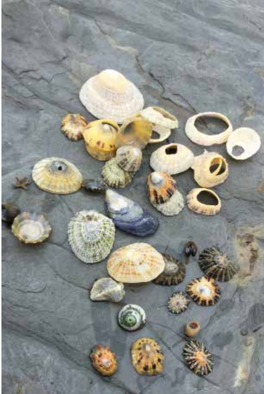
ABOVE CLOCKWISE FROM TOP LEFT Some more of Ami's beautiful jewellery – a sand cast ring of 9ct white gold with a seaweed band and grain set diamonds in 9ct yellow gold. Sometimes, Ami embeds grains of sand from a customer's favourite beach into her bespoke rings; shells collected by Ami when beachcombing; a Dusty Sunset Barnacle pendant, which is made of 9ct yellow gold and fancy rose-cut diamonds

reflected in her jewellery by the hues of the stones: green and blue sapphires, and diamonds in soft tones such as white and pink that evoke clouds and sunsets.