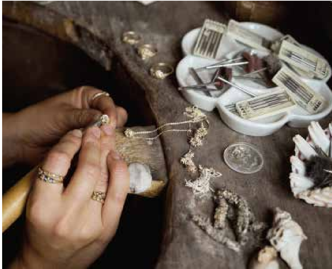
PREVIOUS PAGES West Wales-based jeweller Ami Pepper finds inspiration in the seaweed and shells she finds in the rockpools and along the shoreline of the Pembrokeshire coast ABOVE Ami working on a necklace at the metalworking bench in her studio BELOW Ami collecting shells on Aberbach Beach